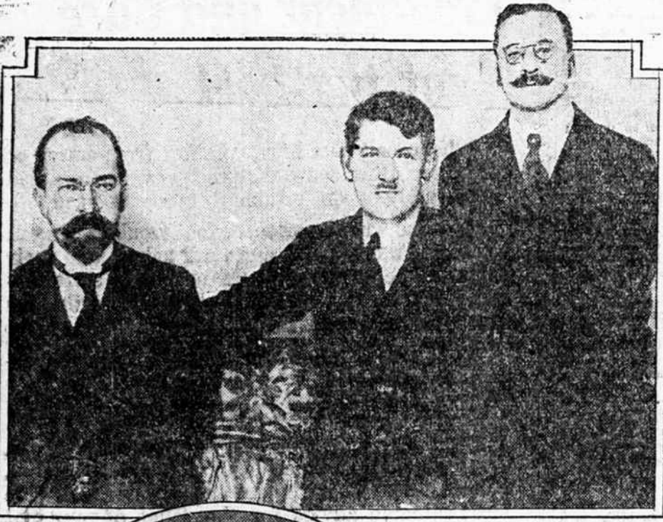
Left to Right: GAVIN DUFFY, MICHAEL COLLINS and ARTHUR GRIFFITHS