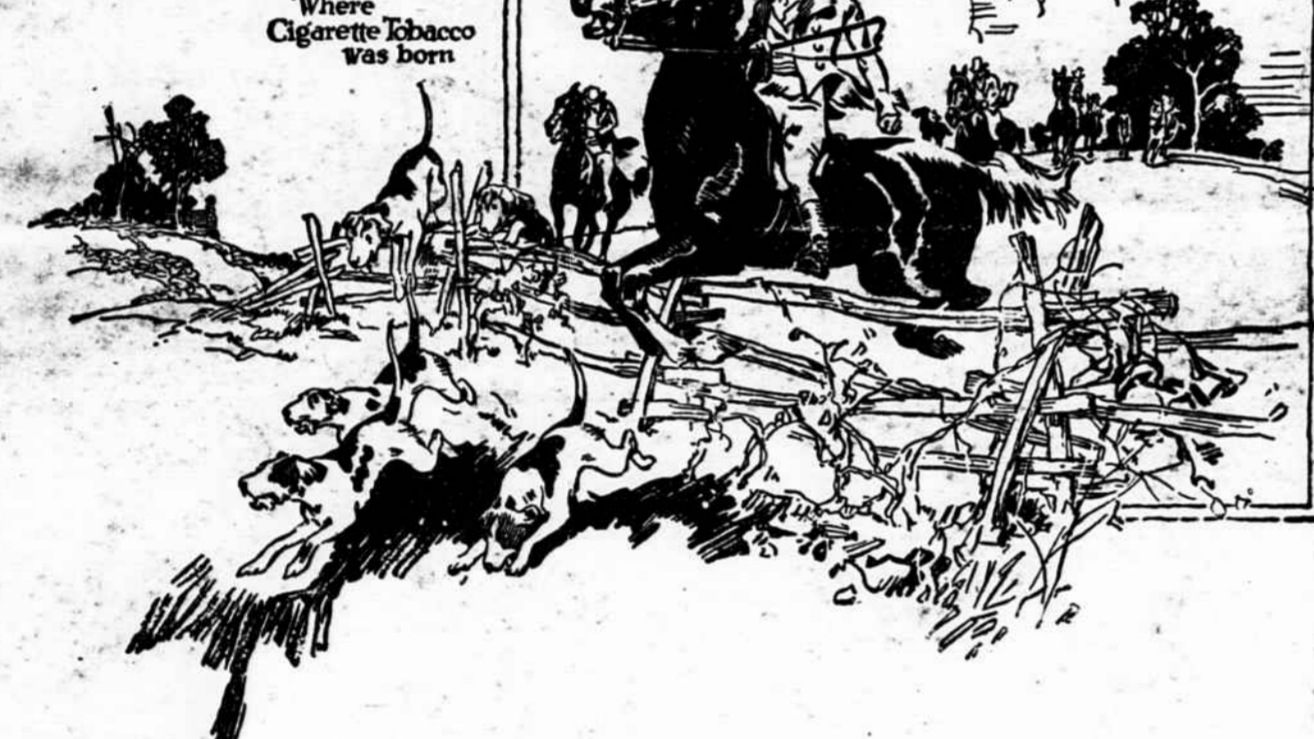
"Along toward early autumn, after the tobacco crop had been cured, and packed away in the barns, the planters from up and down the river would foregather, usually at the Stobridge place, thence to set out on the first fox hunt of the season." —Early Virginia, page 243.