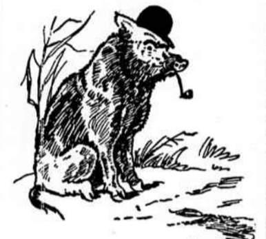
There Are Pens and Pens