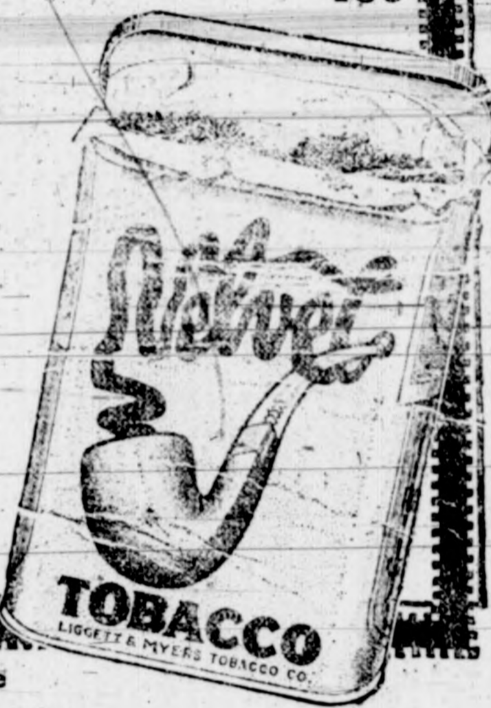
Roll a VELVET Cigarette