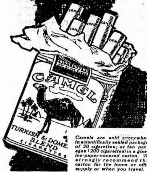
Camels are sold everywhere in scientifically sealed packages of 20 cigarettes; or ten packages (200 cigarettes) in a glassine-paper-covered carton. We strongly recommend this carton for the home or office supply or when you travel.

CAMELS fit your cigarette desires so completely you'll agree they were made to meet your taste!