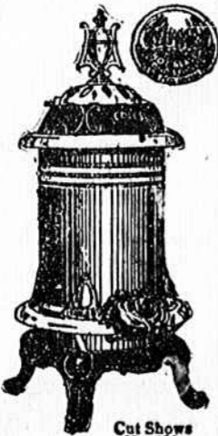
Cole Shows No. 116