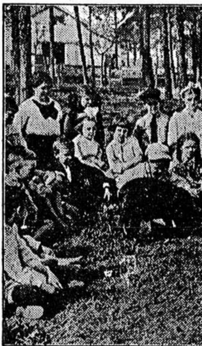
"Soldiers of the Community" Interest in Studying a Young Pig, to Be Shown at the State Fair.

The demonstrations by the boys are closely watched by the adults. The keeping of records showing the initial and final weights, the amounts and