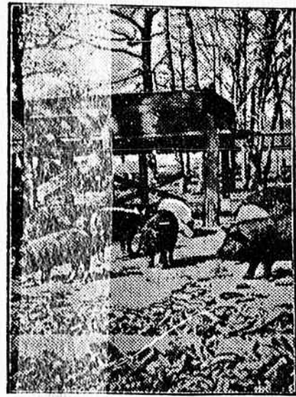
A Good Hog-Feeding Floor Saves Feed and Is an Aid in Fighting Vermin.

No branch of live stock farming gives better results than the raising of well-bred swine when conducted with a reasonable amount of intelligence. The hog is one of the most important animals to raise on the farm, either for meat or for profit, and no farm is complete unless some hogs are kept to aid in the modern method of farming. The farmers of the South and West, awakening to the merits of the hog, are rapidly increasing their output of pork and their bank accounts. The hog requires less labor, less equipment, less capital, and makes greater gains per hundred pounds of concentrates than any other farm animal, and reproduces himself faster and in greater numbers; and returns the money invested more quickly than any other farm animal except poultry. In the trucking and mixed-farming sections of the United States hogs are