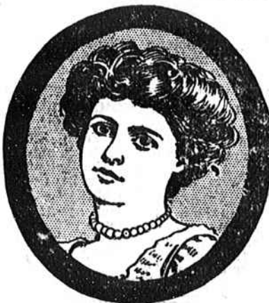
This woman says that after months of suffering Lydia E. Pinkham's Vegetable Compound made her as well as ever.