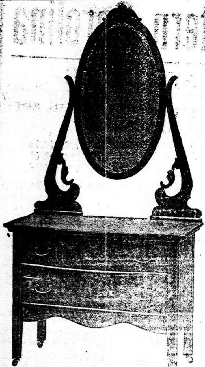
Oak or Mahogany Dresser $8.75

Every odd piece of Furniture in my store at a sacrifice. The reason is easily understood by any customer who enters my store. I have no room and will be forced to handle just a few staple things in the future. A wonderful saving to you if you come quick.