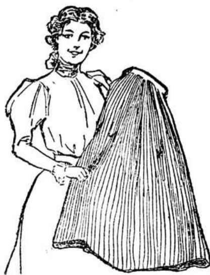
"Tisn't new—It's Diamond-dyed."

Color Over Your Old Dresses, Jackets, Waists, Ribbons, with Diamond Dyes!