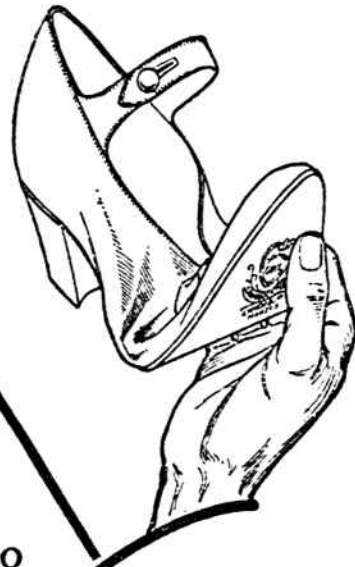
Look for the Red Bell on the box.

Foot muscles that rebel at being bound up in stiff shoe leather should never be forced. Feet that fret make work, fun, or even rest, impossible. If your feet are sensitive, go to our dealer in your town and ask to be shown