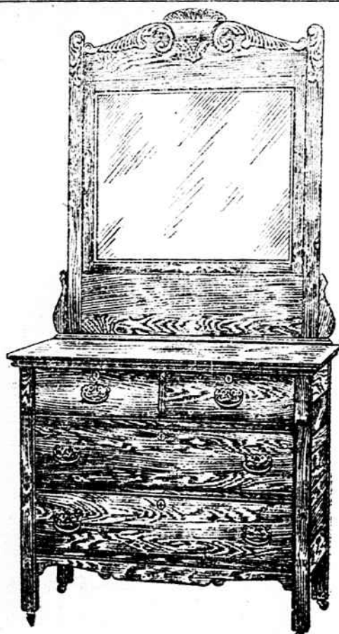
DRESSER, A. B. MIRROR, 22x28 inches. Well made. Well finished. Top 18x42 inches. $8.00.

Oak frame, velour cushions. The kind other dealers are asking $7.50 and $10 for. Our "Lexington price," $5.50. Order by mail.