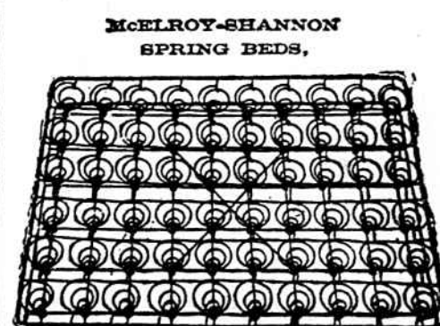
McELROY-SHANNON SPRING BEDS.