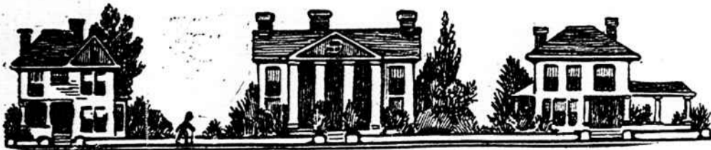
I BUILT AT COLLEGE PLACE.