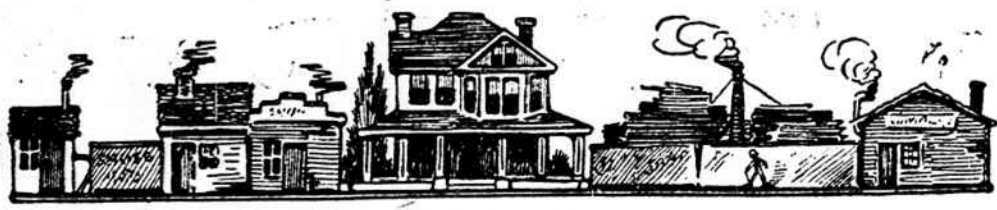
I WISH I HAD.

The accompanying illustrations tell most clearly the lesson of human experience. Some people overlook the fact that a good building amid inferior surroundings is never worth even its approximate cost, while on the other hand desirable environments means satisfaction and profit to the owner. The expense of building in a choice location is no greater than in an inferior one, and the results are as wide apart as the poles.