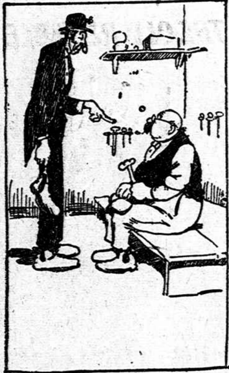
MIT A WEED ON HIS HAT UND A SOLEMN LOOK.

"HANS," says Mr. Vogelestein ash he comes in to see me der odder day, "und don't find me mit no work on hand. 'You vhas some schackass.' 'What for?' I asks. 'Because you don't make yourself some peesness. Do you relief I would sit here like some bumps on a log if I vhas a cobbler? Not mooch! I haf ten customers before noon tomorrow.' 'Would you drag 'em in mit a rope?' 'Of course not. You come out in der back yard mit me while we drink der growler und I make it plain to you.' 'Dot night I put a sign in my window. She reads: 'Some poetry made oop for all customers while he waits, by der Sherman poet.' 'At 8 o'clock in der morning a woman comes in mit two shoes to be patched, und pooty soon she says to me: 'If I know you vhas a Sherman poet