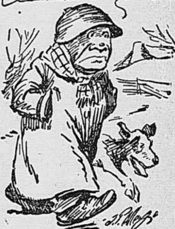
Copyright, 1921 by McClure Newspaper Syndicate.

AH DODGED A MAN FUH DE LONGES' T KEEP OUT DOIN' SOME WORK FUH 'IM EN NOW ATTEH AH'S DONE DID DE WORK HE BIN DODGIN' ME!