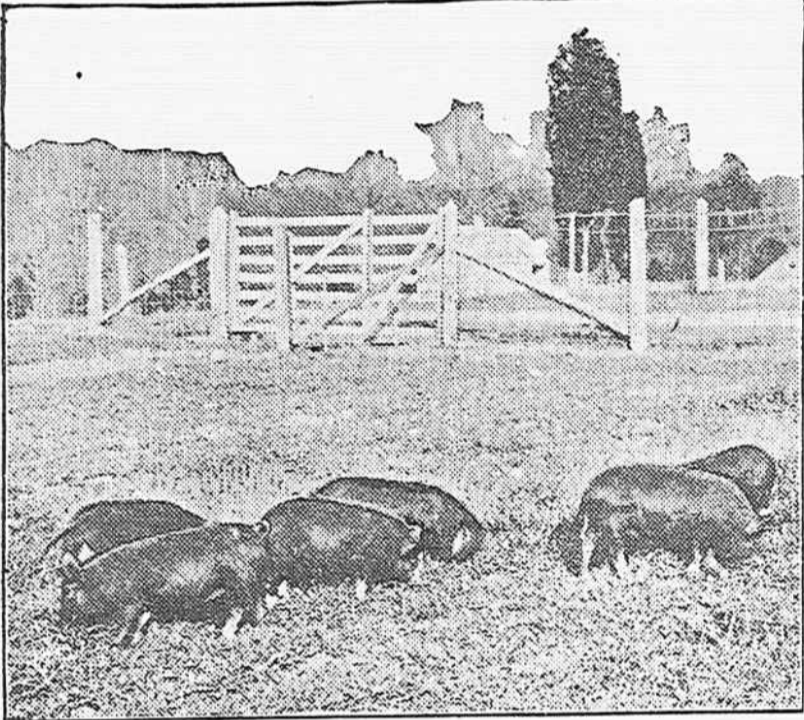
WEANED PIGS ON SUCCULENT PASTURE.

The cuts may be made with a knife, but the most convenient instrument is a punch which nicks the pigs' ears quickly and makes a clean cut.