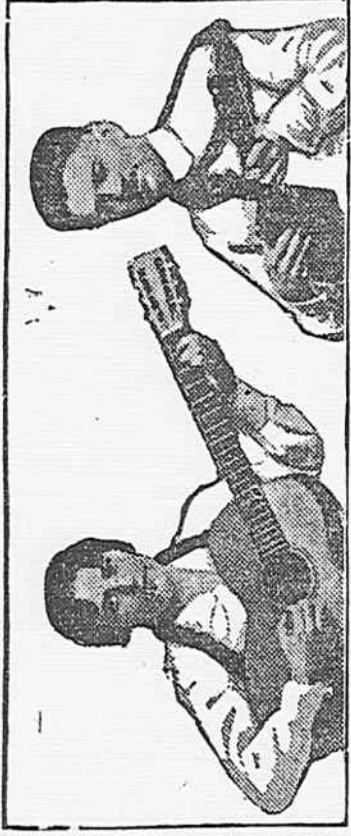
THE HONOLULU ENTERTAINERS.