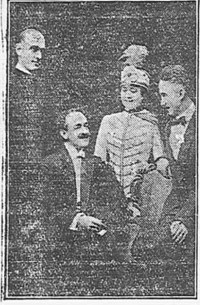
EUGENE LAURANT AND COMPANY