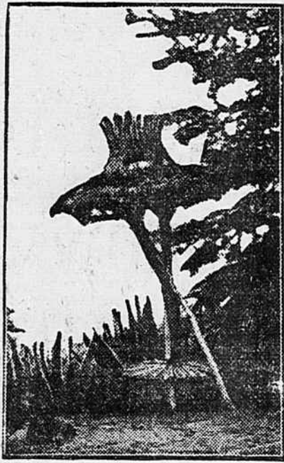
Attractive Summer Seat and Shade Built About the Trunk of a Dead Tree.

The fact that summer rest seats do not have to be expensive to be attractive is demonstrated in the seat seen in the accompanying illustration. The seat has been termed the "Tree Summer Seat," from the fact that it is really built around a tree which was at one time growing at the point where