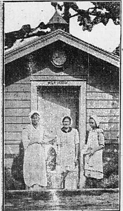
A Model Dairy House Where Cleanliness is Paramount.

A windmill on the side nearest the refrigerating tank will pump cold water from the well into one corner of