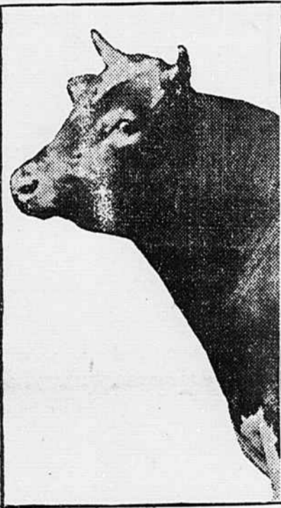
Endymion, Grand Champion Bull.

If the use of bulls from dams and paternal grand-dams producing less than 300 pounds of fat were prohibited by state law it would be a long step in advance. Much damage has been done by unscrupulous and ignorant breeders, who have sold, for breeding purposes and at low prices, pure-bred male calves from cows