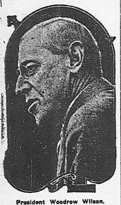
President Woodrow Wilson.

section of this committee was ruled by a majority of Republicans, but there is Democratic testimony to the fact that the Republican senators were willing to outdo their Democratic brethren in the work of making orderly and impressive the inaugural ceremonies in honor of two chieftains of the opposition.