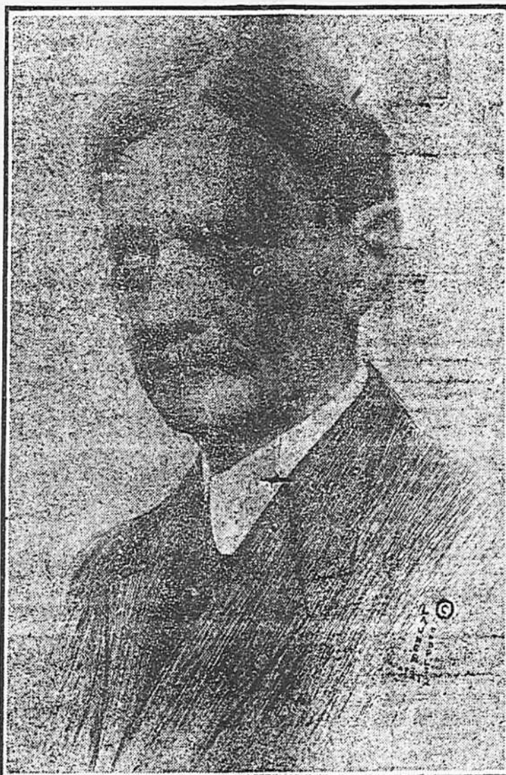
MRS. THOMAS R. MARSHALL Wife of the Democratic Vice-Presidential Nominee. Honorary Vice-President Woman's National Democratic League.