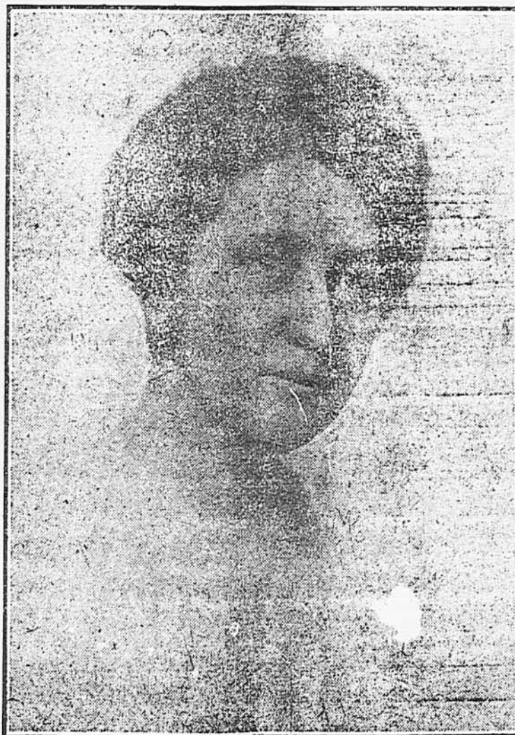
Mrs. Thomas R. Marshall, wife of the vice-presidential nominee of the Democratic party, is a keen student of affairs and as the constant companion of her husband has had an exceptional opportunity of specializing on human nature. A very practical and far-reaching result of this peculiar interest in the larger family of the state—she has no children of her own—is found in the long list of humanitarian bills passed by the Indiana legislature during her husband's regime as governor. A bill to curtail child labor bears the list, which numbers twenty, and includes almost every legal corporation for the immediate relief of labor, especially for that pertaining to women and children.