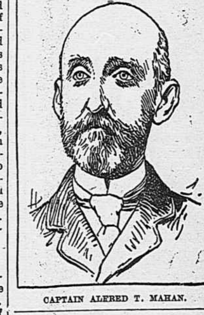
CAPTAIN ALFRED T. MAHAN.

Flour and the X-Rays. The X rays are showing us many interesting things, among them the difference in the qualities of pure and adulterated foods.