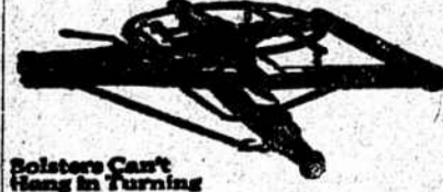
Bolsters Can't Hang in Turning

Full Circle Iron Malleable Front Houn Plate