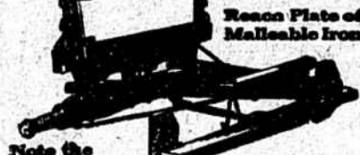
Note the Adjustable Brake Lever

On the front bolsters of Thornhill wagons are heavy iron plates running along top and bottom—connected by rivets that run clear through the bolster. Strength and lightness are combined. Rear gears are strongly ironed. There are braces on both top and bottom that extend the full length of the houns. Solid trust bars extend the full length of the axles giving them double strength.