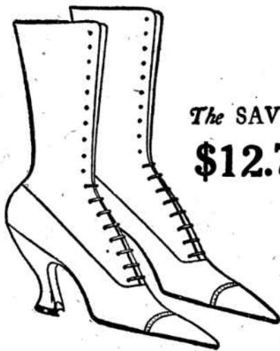
The SAVOY $12.75