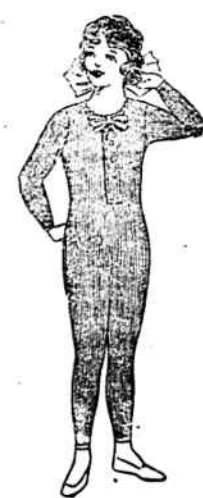
Girls' Union Suits all sizes 75c and 85c

Clothing, Shoes, Hats, Ladies' Hats, Skirts, Underwear, Cloth of all Kinds, Crockery, Tinware. Everything You Want This Fall--See The Hot Hustler Racket and Get the New Styles at Lowest Prices.