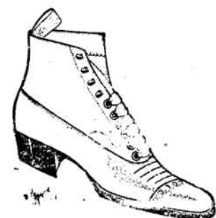
Tan and Black $4.98