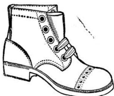
Men's Heavy Work Shoes $3.48 to $4.98

We want your business, will give you a square deal, sell you at the lowest prices, and treat you as nice as we know how. Don't miss us. Come to see us.