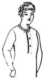
75c Undershirts and Drawers