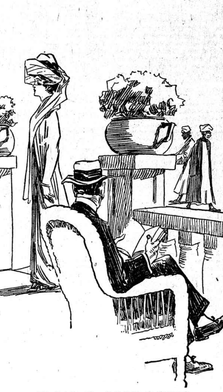
This Girl Was Elegant, in Dress, in Movement.

edness, misery and death itself. It is a common observation that objects in the reality which would shock, are, in tragical and such like representations, the source of a very high species of pleasure. This, taken as a fact, has been the cause of much reasoning. This satisfaction has been commonly attributed, first, to the comfort we receive in considering that so melancholy a story is no more than a fiction; and next, the contemplation of our own freedom from evils we see represented. I am afraid it is a practice too common, in inquiries of this nature, to attribute the cause of feelings which merely arise from the mechanical structures of our bodies, or from the natural from or constitution of our minds, to certain conclusions of the reasoning faculty on the objects presented to us; for I have some reason to apprehend that the influence of reason in producing our passions is nothing near so extensive as is commonly believed.—Edmund Burke.