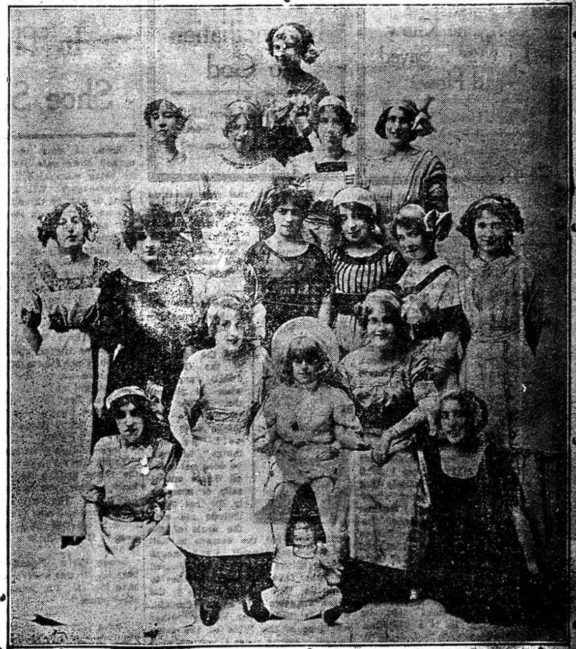
A ray of sunshine amid a sunburst of roses, Buster and chorus, in the all new and everlasting comedy, Buster Brown, at the Grand Opera House, Friday night, April 12th.