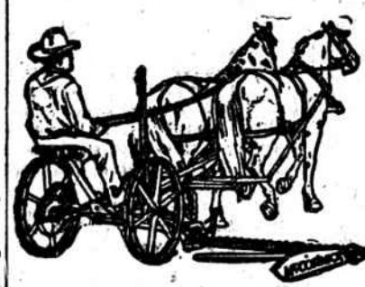
McCORMICK. ..... FOR SALE BY .....