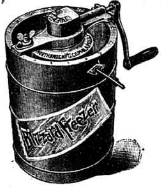
These two Freezers are the best made and you will find them reasonably priced here in all sizes.