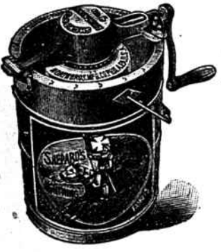
We also have The American Twin and White Mountain.

"Whatsoever Ye Sow." "There recently appeared in a popular magazine an article on the special fierce competition encountered by American manufactures in Central and South America, but this is an example of what American-made goods—say Nashville-made goods, can accomplish." From Bluefields, Nicaragua, the Phillips & Butterfield Manufacturing Company recently received an order for the sixth double oven National Steel Range, "to be packed in 126-pound sections, for transportation part of the way on mule-back." This harvest is the outcome of the accidental sale of a National Steel Range there some months since, which had proven so sterling in endurance and good service that when others needed a like equipment, the National Steel Range was the only one considered, even though necessary to bring it a thousand miles.