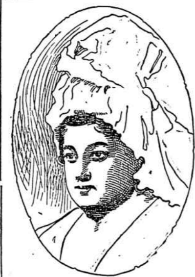
THE MINIATURE OF HIS WIFE THAT WASHINGTON WORE FOR FORTY YEARS.