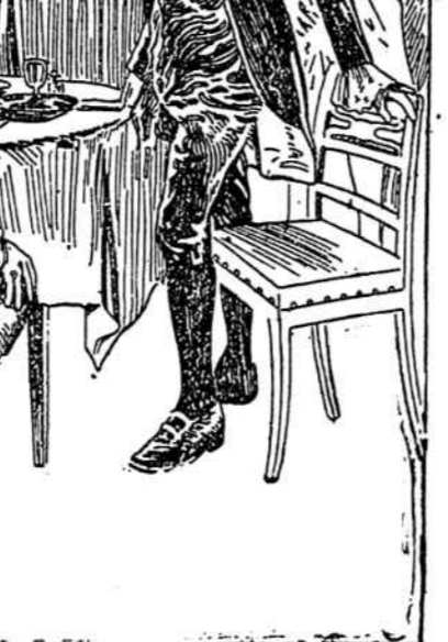
WASHINGTON'S LAST BIRTHDAY.