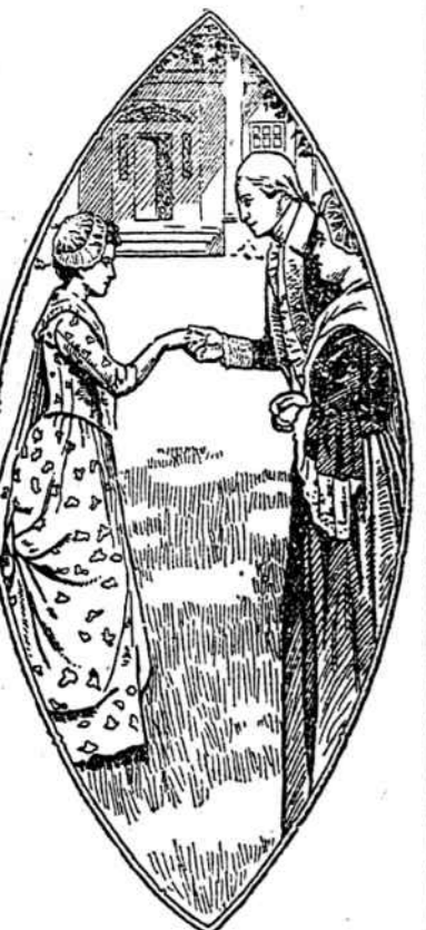
WASHINGTON AT MOUNT VERNON.