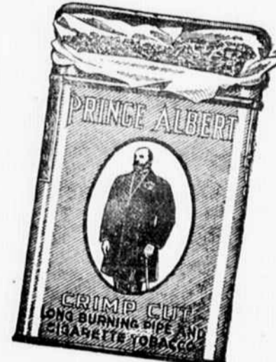
The tidy red tin, 10c

Unlimber your old jimmy pipe! Dig it out of the dark corner, jam it brimful of P. A. And make fire with a match! Me-o-my!