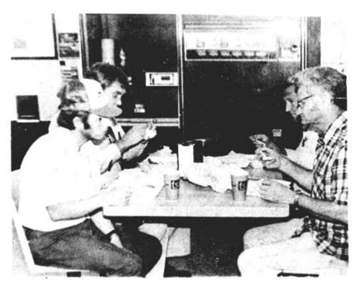
Employees pleased with all anniversary celebration activities.