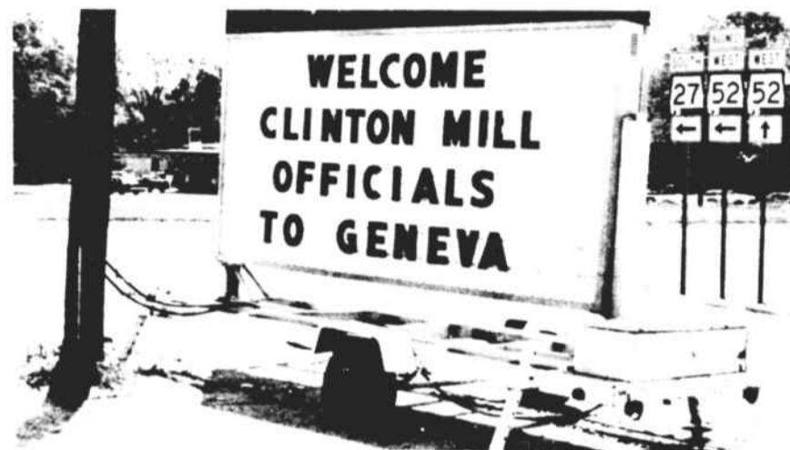
Signs Of The Times —This is one of many signs displayed throughout the City of Geneva welcoming officials to the city.