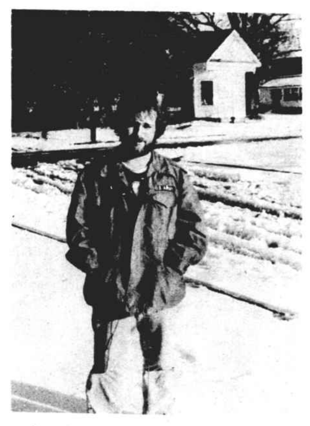
Many found the snow pleasant despite difficulties getting to and from work.