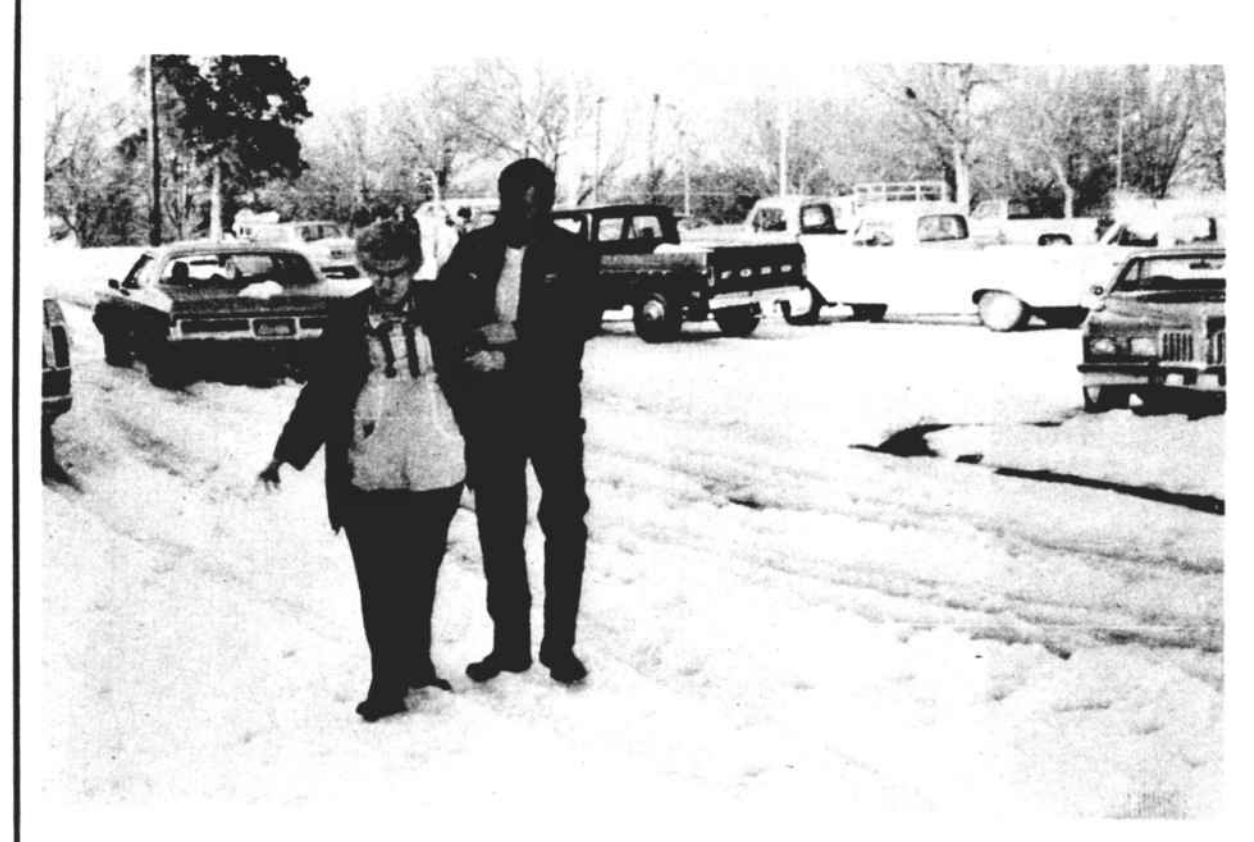
Some employees needed a little assistance in arriving safely.