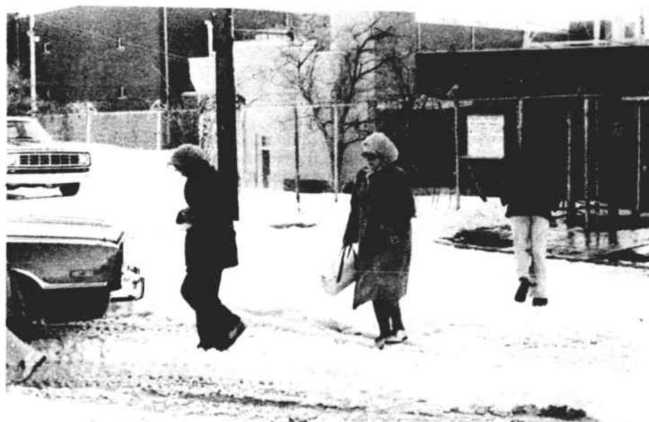
Some were happy to see the snow begin to melt.