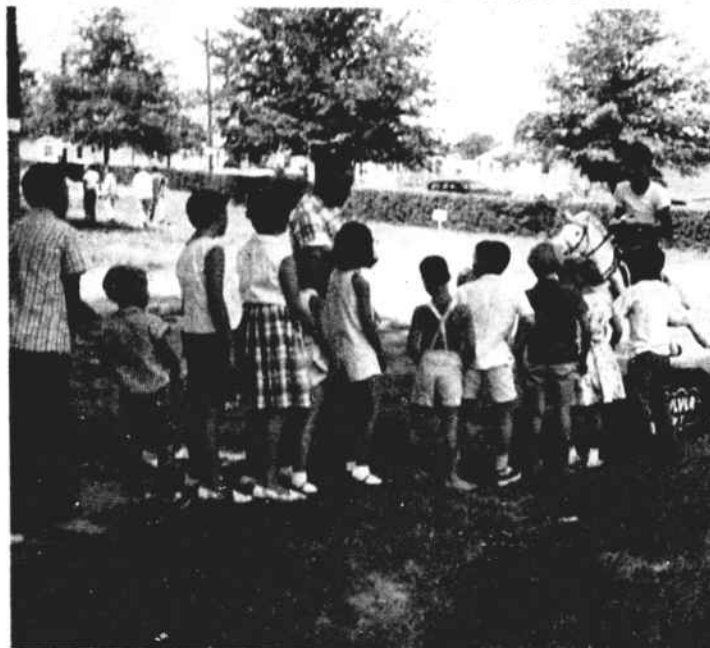
Silver's saddle club.