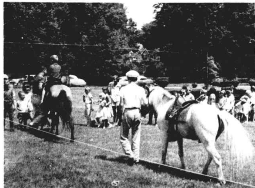
Wasted "Pony Power"