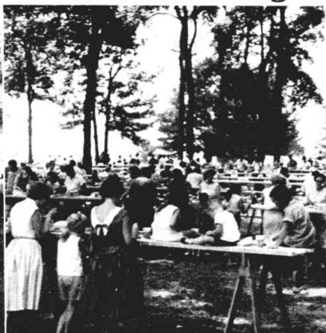
Sittin' up to chow down.