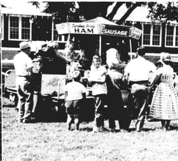
Round and round she goes!