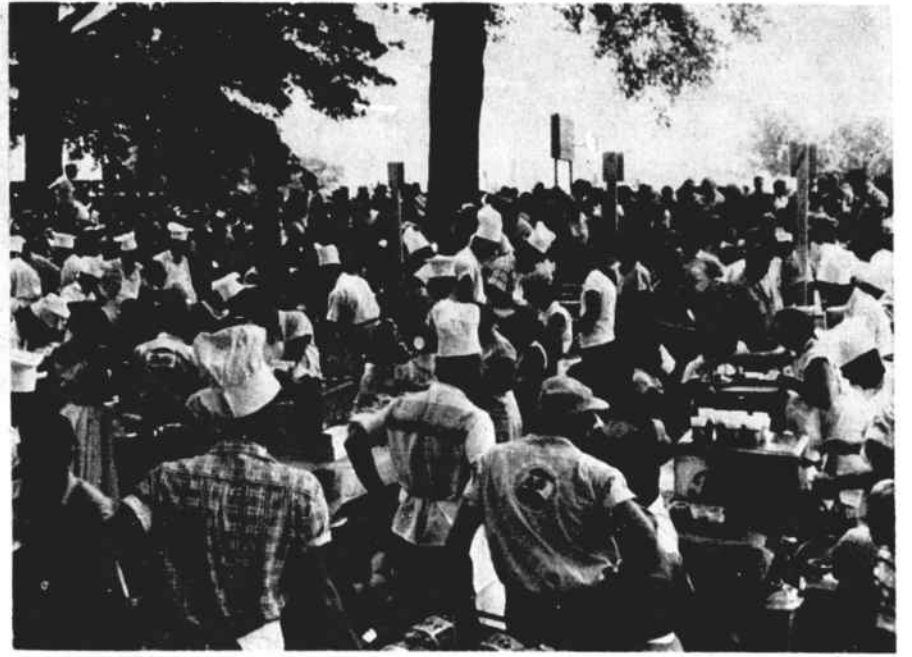
"Bar-B-Q Bobs" and "Pepsi Petes" serving it up.

Scenes from the LYDIA MILLS Million Safe Man Hour