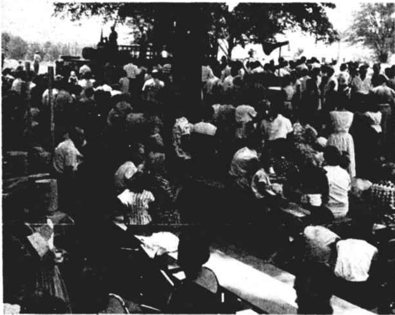
Carolina Promenaders entertain.