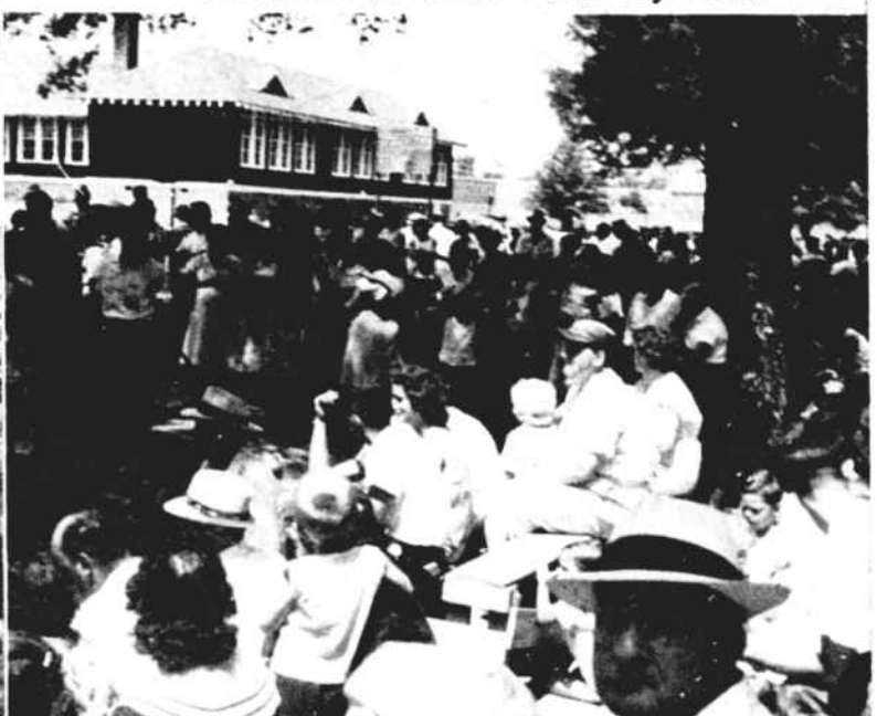
Just before high noon.