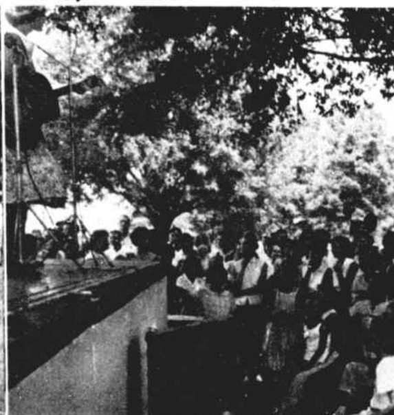
Young rock-and-roll fans.