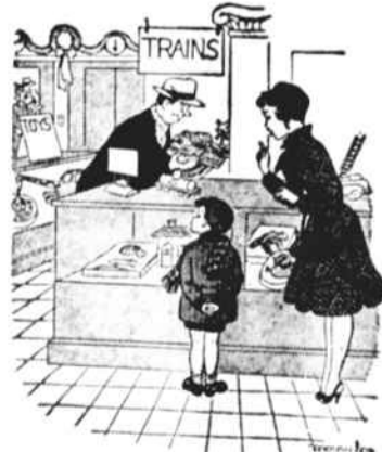
"Now keep an eye on your father while I'm gone!"