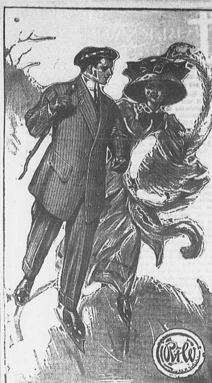
Designed by Rosenwald & Weil, Chicago.