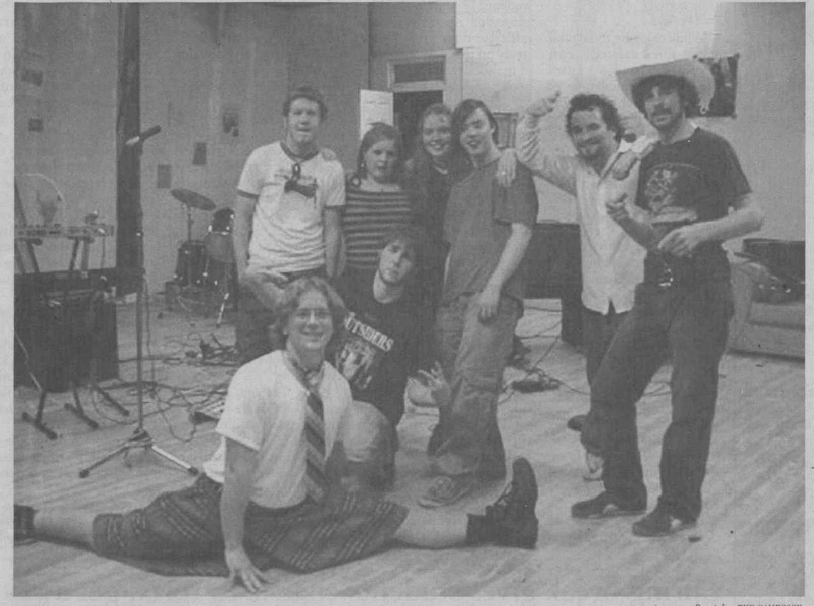
Members of the USC theater group the Puppet Regime are sponsoring a benefit concert at Benson Theater on March 12. The event features Columbia bands JuiceBox and Yukos the Crude, and proceeds will benefit Harvest Hope Food Bank.