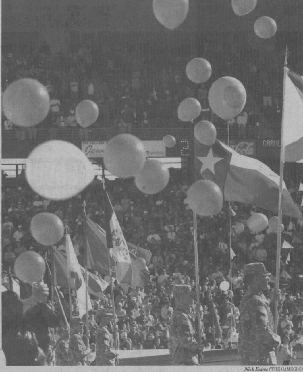
Fans cheer on members of the U.S. armed forced during halftime of Saurday's football game.