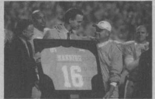
Former Tennessee quarterback Peyton Manning has his jersey retired