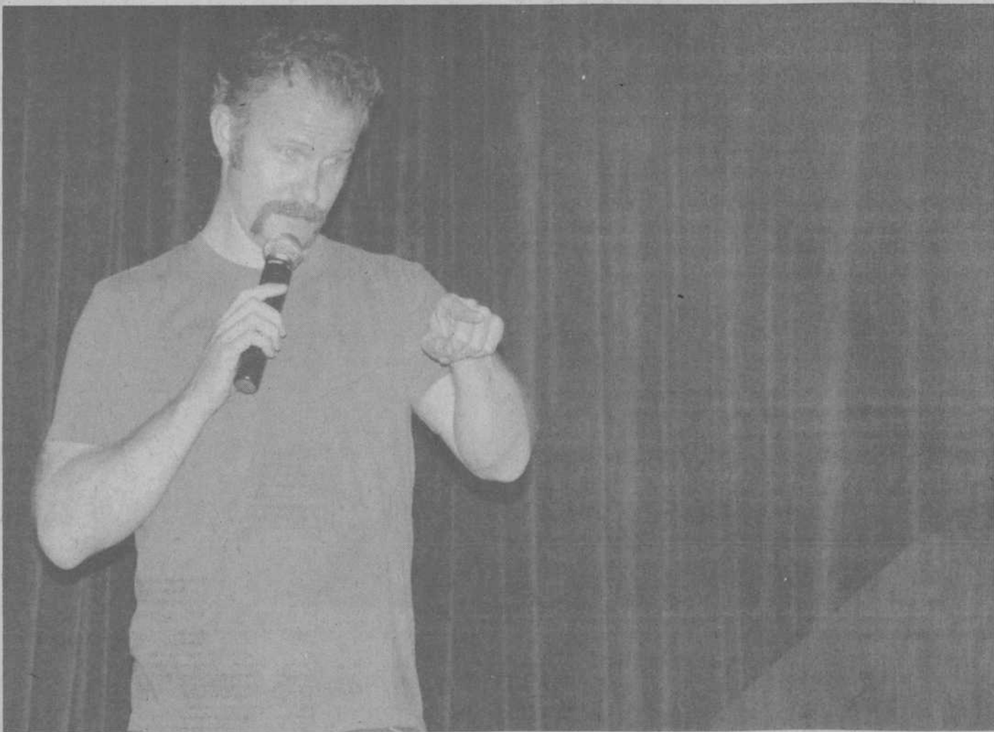
Morgan Spurlock, creator and star of the film "Super Size Me" talks to students Tuesday night in the Russell House Ballroom.