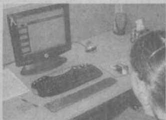
Kimberly South for THE GAMECOCK

If students have more than 20 gigabytes of data on their personal computers, an