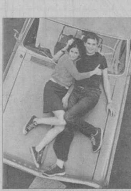
Peet and Kutcher find on-screen chemistry. living at home. They