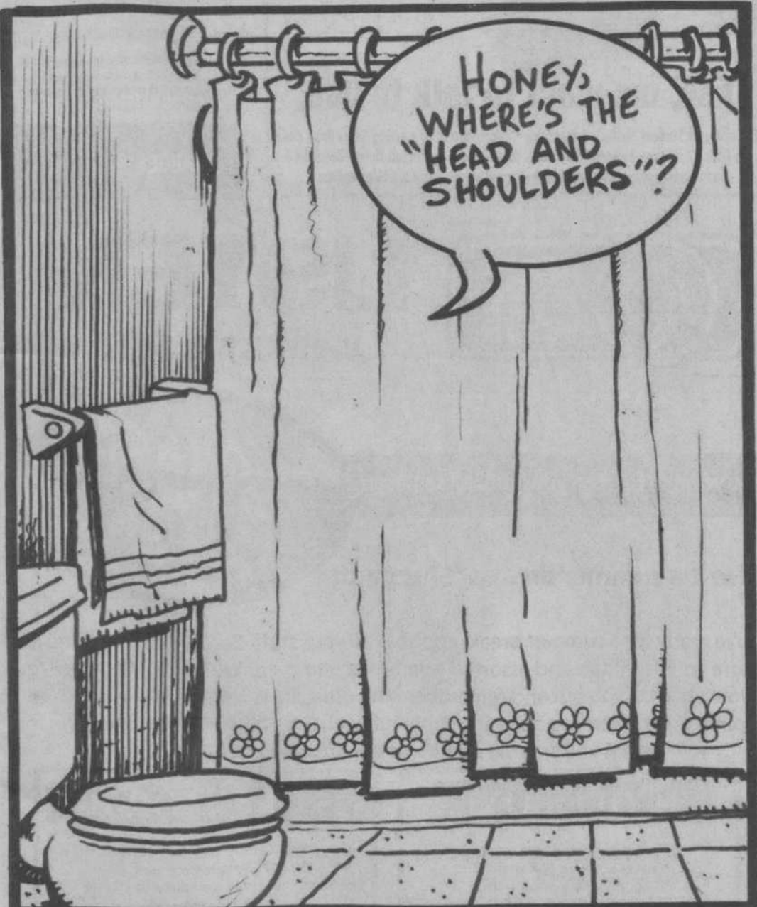
The Invisible Man takes a shower.