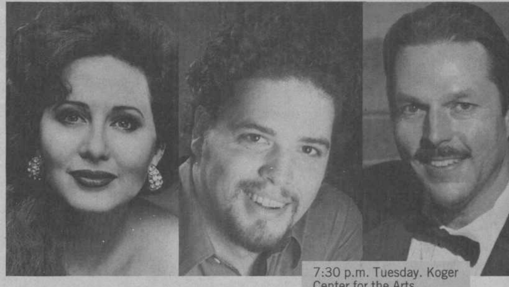
7:30 p.m. Tuesday. Koger Center for the Arts.