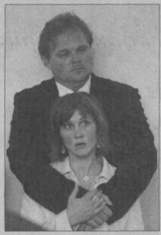
Tracey Gold Marshall, 35, stands with her husband Roby Marshall, 39, at the Ventura County, Calif. Courthouse