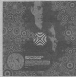
"The Cosmic Game" Thievery Corporation