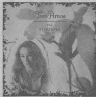
"The Beekeeper" Tori Amos