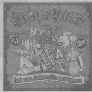
"Fast Car Danger Fire & Knives" Aesop Rock

Do guns kill people, or do people kill people?