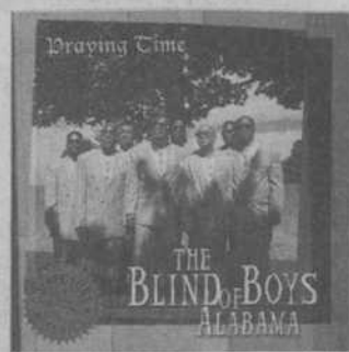
"Praying Time" Blind Boys of Alabama