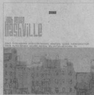
"Nashville" Josh Rouse