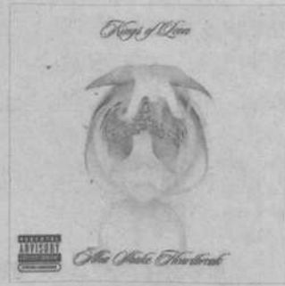
"Aha Shake Heartbreak" Kings of Leon