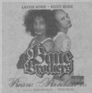
"Bone Brothers" Layzie Bone & Bizzy Bone