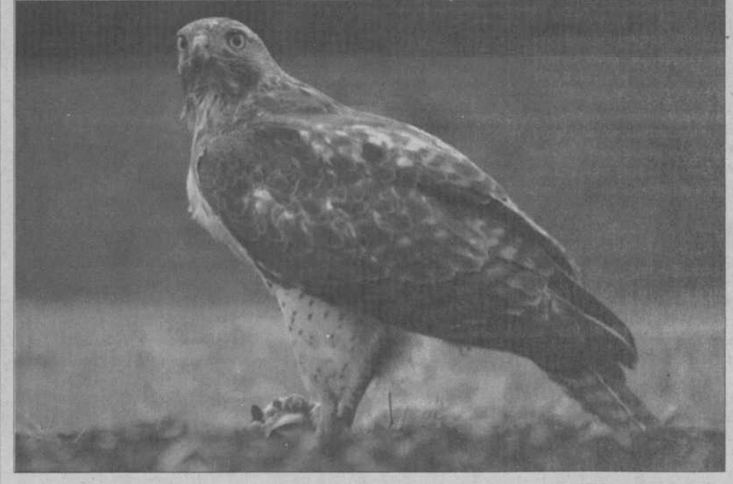
A small crowd gathered to watch this red-tailed hawk eat a squirrel in front of the Russell House on Thursday evening. Curious students moved to within 20 feet of the hawk before it flew away clasping the squirrel carcass in its talons.