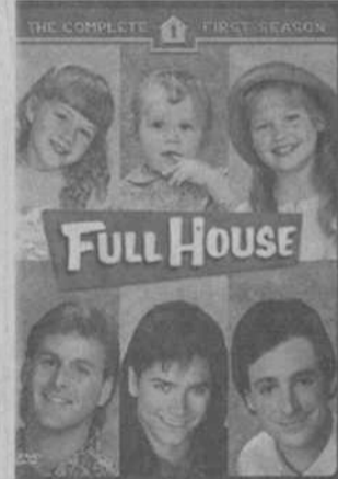
"Full House - 1st season"